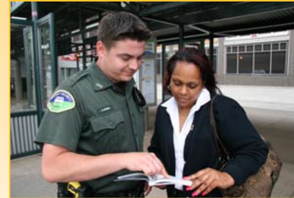
Pierce Transit is Washington's only public transportation agency with a commissioned police department.

Passenger safety is our top priority. Pierce Transit's nearly 1,000 employees have a well-deserved reputation for going above and beyond the call of duty to meet customer expectations.